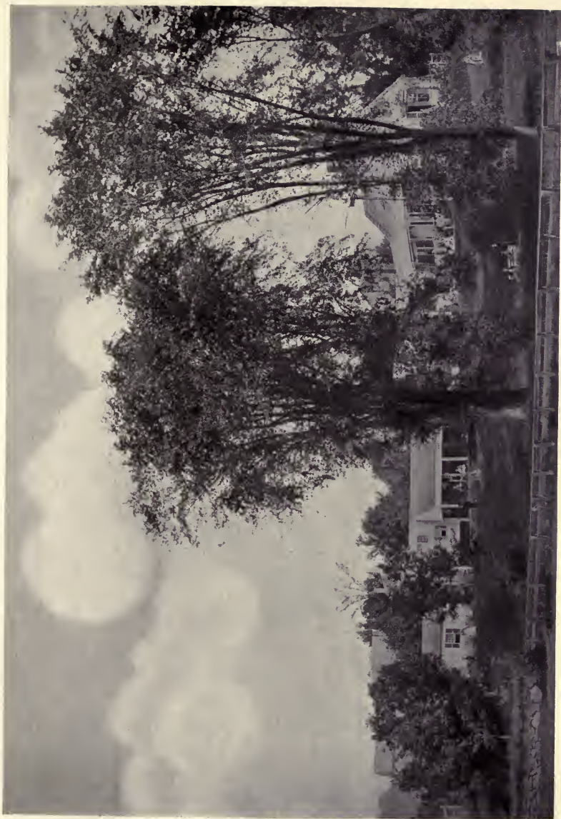
THE FEWACRES HOMESTEAD AT FARMINGTON, MAINE